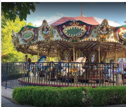
Carousel—50 S Main Street, St. George

Tuacahn Website: https://www.tuacahn.org/ *