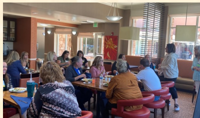
First Time Attendee Luncheon